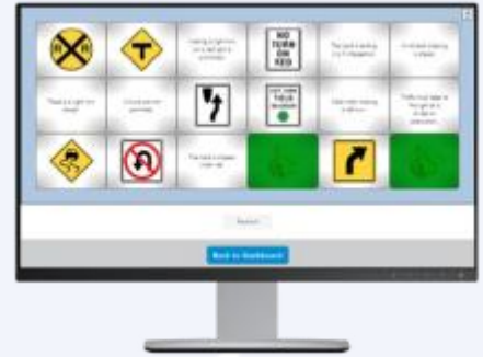
Driver's Ed Online Courses

Course materials are accessible through a third-party, user-friendly LMS and on all devices. Course progress is automatically saved so students can pick up right where they left off. Once they've finished the course, students can take their final test online, and after passing it, will earn their Certificate of Completion from an appropriately licensed school.